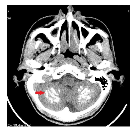
Figure 2. Axial non-contrast cerebral CT-scan. Calcifications of cerebella.